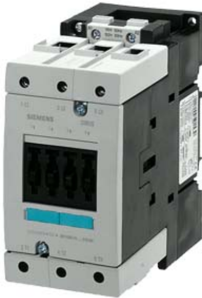
CONTACTOR, AC-3 30 KW/400 V, AC 110V 50HZ/120V 60HZ 3-POLE, SIZE S3, SCREW CONNECTION